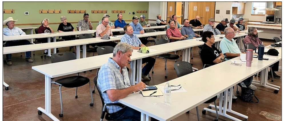
Shown are some of those from the Lower Arkansas Valley who attended the September 9 meeting for Arkansas Valley Conduit participants in Rocky Ford.