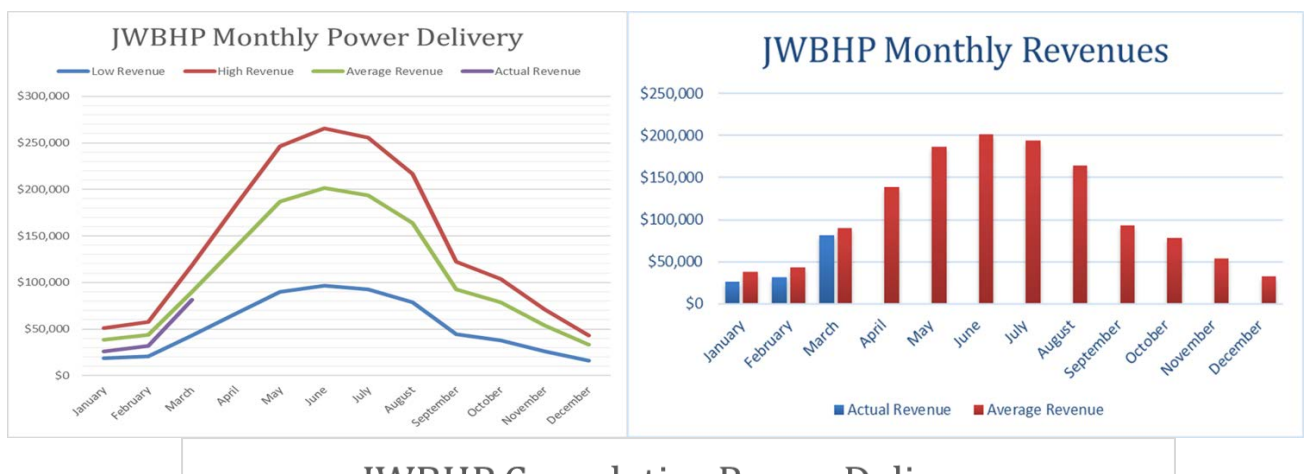
Page 2 RESOURCE AND ENGINEERING PLANNING COMMITTEE MINUTES April 6, 2023